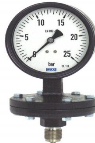
Diaphragm pressure gauge model 422.12